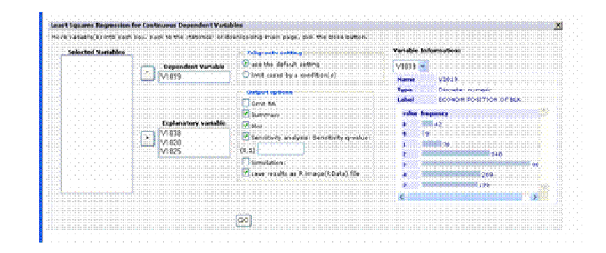
Figure 2: Screenshots of the Shared Catalog Interface

Harris National Studies (ODUM:MAIN.HEADING) (ODUM:SUBHEADING) <u>Disabilities</u> (ODUM:INDEX.TERMS) (ODUM:SUBJECT.TERMS)