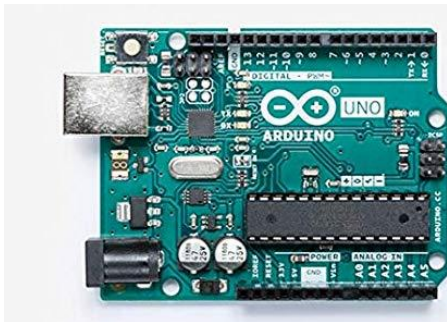
Figure 1 Arduino Platform