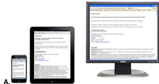
A. Figure 1A: Same Content Presented on the three devices tested in the study.

Increasingly, users own and operate multiple computing devices. Typically, these devices have different form factors including different screen sizes and interaction devices/techniques. Switching between these devices to perform the majority of tasks has been considered costly in terms of efficiency and usability for some types of tasks. Only under certain circumstances, like being in a mobile context, would the typical user try to perform a complex task on a mobile device in the same manner as they would