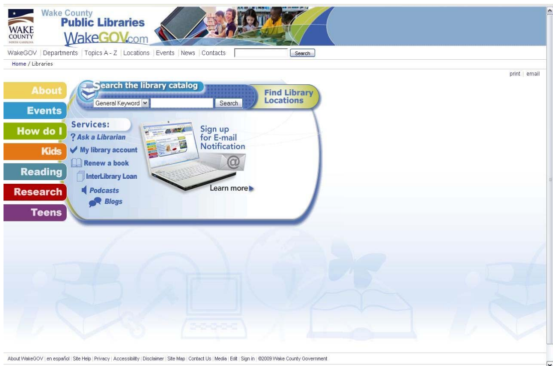
Image 4. Wake County Public Libraries homepage.