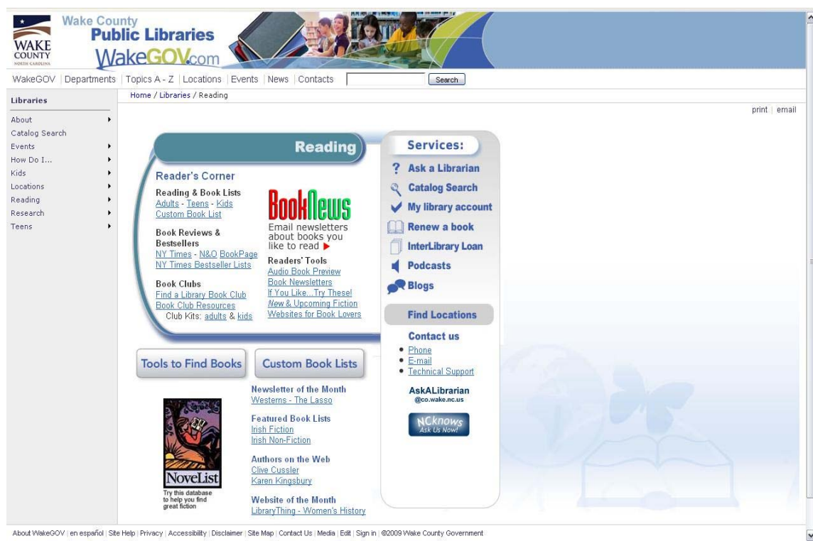
Image 5. Wake County Public Libraries Reading page.