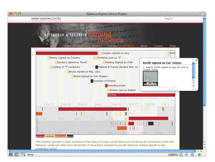
Figure 2. SIMILE-based timeline from 2008 course

While the example above is admittedly simple and anecdotal, it is important to recognize that as information systems increasingly become Web-based, the developers of these systems are increasingly more likely to resemble the students in the digital library course example than expert programmers with computer science degrees. The growing quantity of information resources becoming available in digital form naturally leads to a corresponding interest in creating focused collections of these information resources in a broadening range of disciplines and domains. The growth of digital libraries and digital media collections is one example of this, as are the efforts by publishers to provide increasingly feature-rich systems around their content. While, for instance, the New England Journal of Medicine might have the resources to hire computer science graduates to develop useful new features for their medical resource-based information seeking system [3], there will be many other situations (in archives, museums, and libraries, for example) where the people responsible for creating new information seeking systems do not have particularly strong programming backgrounds and are, in some cases, hired more for their domain expertise. Building blocks could help these developers better contribute to the creation of useful systems in new domains.