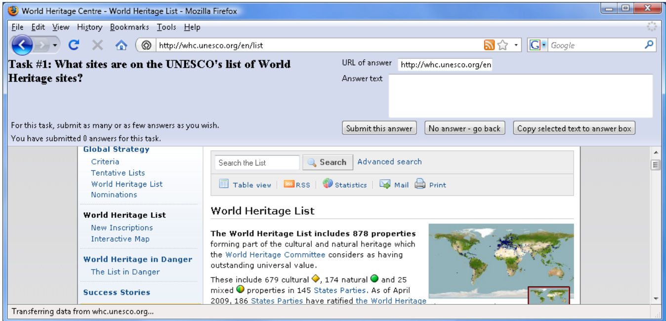
Figure 2. HCI Browser – Main Browser Window