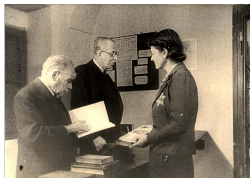
Figure 3: Library in Nazi propaganda film, 1944

Theresienstadt entitled, “Die Führer Schenkt den Juden