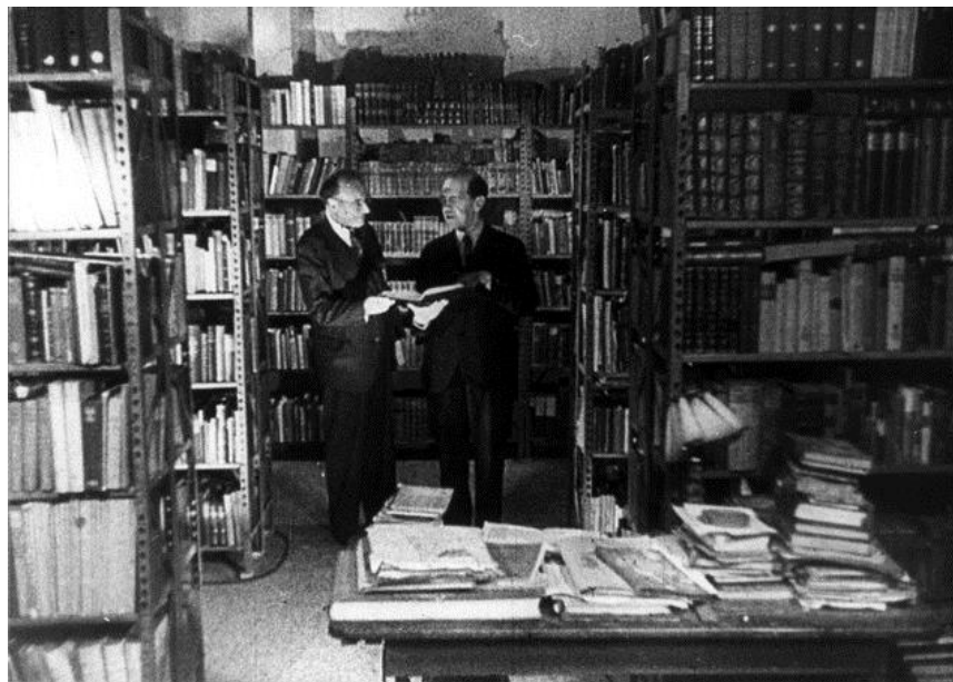
Figure 5: Ghetto Central Library in Nazi propaganda film, 1944

Theresienstadt prisoners chose to read as an act of defiance, an act of refuge and escape, and as an act of intellectual resistance, a sentiment that can be and often still is echoed today in times of great stress. Soheli Begum poignantly explains the importance of reading in challenging and even horrific life circumstances in her article on readers' advisory and escapist reading, stating: "Reading as refuge from terror or decidedly difficult life situations is a testament to humanity and the refusal to become complacent prisoners, regardless of one's surroundings." 66 Indeed, the prisoners at Theresienstadt (see figure 5) 67 , whether they survived to see the liberation of the camp or not, were clearly not complacent prisoners and their reading habits while in Theresienstadt provide genuine evidence of the incredible impact that reading can have on individuals and humanity as a whole.