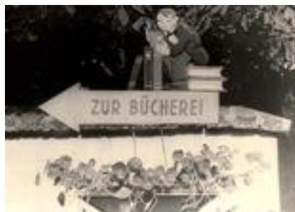
Figure 2: Ghetto Central Library Sign

detail later, but also for the Nazis running the ghetto and camp. Of