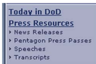
Fig 8. Bulleted list

easily scanned. Introduce each list to reveal the information to follow (Research-Based Web Design, 116). The navigation bar in Figure 8, is introduced the press resources listed below it. The most of the important information should appear at the top of each list to give users the quickest access to information and news releases, the most important link, appears first in the list (Research-Based Web Design, 113) The first letter of first word in the lists is also capitalized to facilitate scanning (Research-Based Web Design, 119).