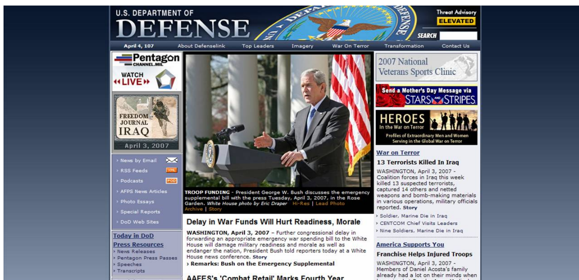
Figure 1. Top half of the Department of Defense homepage

Creating a positive first impression is important for a government agency because users judge the quality of the website from the homepage. (Research-Based Web Design, 37). The DoD website is very lively. The title banner contains an interesting graphic of the DoD seal and the top of the site has clickable colorful banners of the top news stories and features. At center is a constant rotation of photos subtitled with teasers to other news stories. These features give the webpage a professional appearance but they also impart upon the user the complex and fast paced nature of the organization. The dark blue color and the threat level graphic at the top right lends to an austere appearance that is in keeping with its current wartime mission.