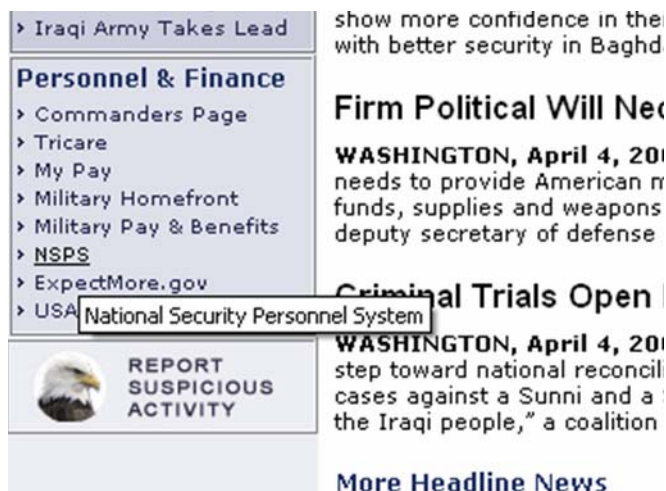
Figure 6. ALT tags

the organization to use the preferred terminology in its organic state (Research-Based Web Design, 99). The DoD website currently uses ALT tags to assist users with acronyms and abbreviations.