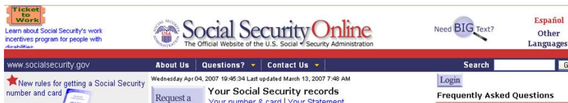
Fig 9. Font characteristics

headlines to attract the user's attention. In contrast, the navigation lists on the DoD homepage contains much smaller font that is difficult to read.