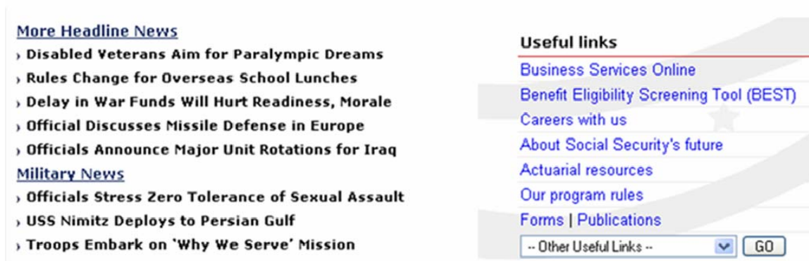
Figure 5. Links to related content

Designate used links by using color changes to signal to users that a link had been visited because it improves users speed in finding information (Research-Based Web Design, 92). The DoD website does not have this feature. On the SSA website used links turn to a darker shade of blue.