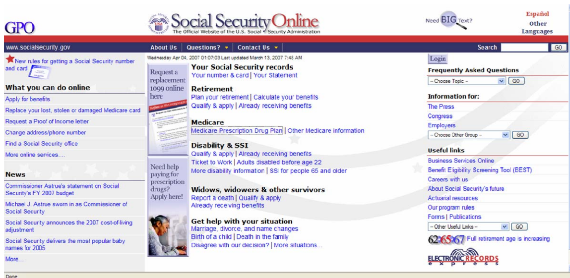
Figure 2. Social Security Administration homepage

The SSA homepage is more service-oriented. It has a simpler and more functional appearance than that of the DoD. The title banner contains a picture of the SSA seal and title is in a solid color with a simple font type. At the center is a listing of services offered on line and the majority of the elements on the page provide additional access points to those services. The colors are muted with the exception of red used only to highlight important services or information. I was surprised to find that SSA homepage offered no “qualify and apply” options for Medicare, just information. Yet, when I clicked through and the destination page included a place to qualify and apply.